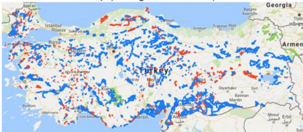
Turkey open irrigation channel map

Markets: Estimated total product quantity in Adana City: 50 units (for only 4 big channel) Estimated total product quantity in all Turkey: 2200 units or more according to following map.