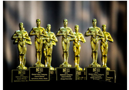
Join the Academy Awards of Cleantech

Join leading cleantech investors, entrepreneurs, corporations and Cleantech Open finalists from across the country and around the world for three amazing days. Register today at www.cleantechopenglobalforum.org