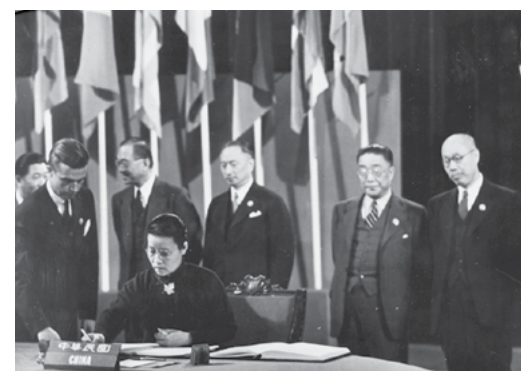
Signing of the U.N. Charter at the Herbst Theatre 26 June 1945