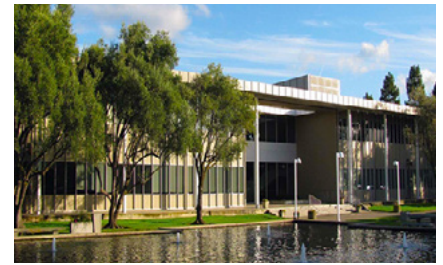
GSVlabs, Redwood City

This is the day when finalists, selected from the eight regions of the Cleantech Open around the U.S., the six countries of the Global Cleantech Innovation Program (GCIP) and the 20+ countries of Global Ideas will all present to panels of carefully-selected judges. From these sessions, the winners of this year's programs will be chosen.