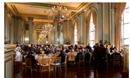
Book your Seat at the 2015 Gala Dinner in the Herbst Theatre Green Room

The Cleantech Open is a 501(c)(3) not-for-profit public-benefit corporation. We find, fund and foster entrepreneurs with the big ideas that will address today's most urgent energy, environmental and economic challenges.