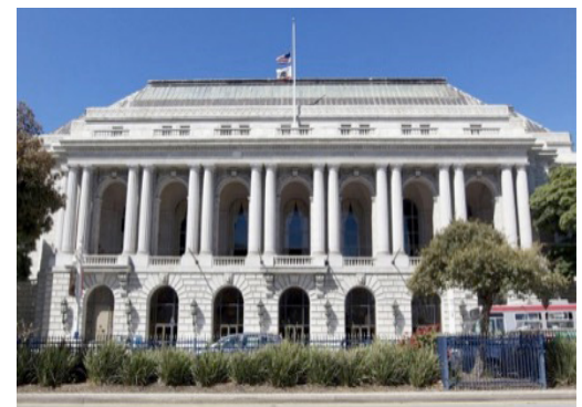
The Historic Herbst Theatre