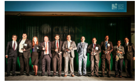
GCIP 2014 Winners from Turkey, South Africa, Pakistan, India, Armenia and Malaysia

We throw the doors open wide at GSVlabs in Redwood City, the Cleantech Open's new home. Join us for the afternoon Expo to meet investors and innovators from around the world, and mingle with them all over wine and appetizers at the evening reception.