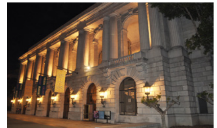
The Historic Herbst Theatre

And you can support the Cleantech Open for its next ten-year journey by booking your seat at the Ten-Year Anniversary Gala Dinner in the magnificent Green Room at the Herbst Theatre.